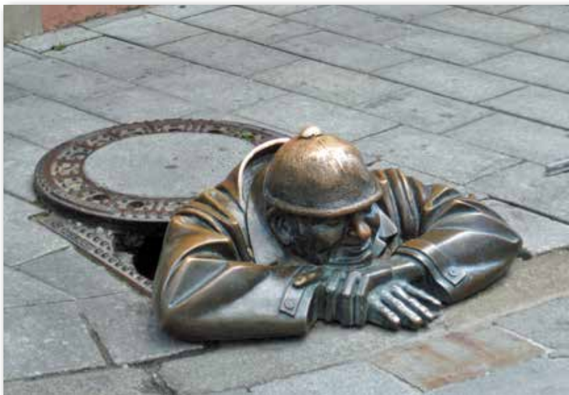
Tap on his head for good luck