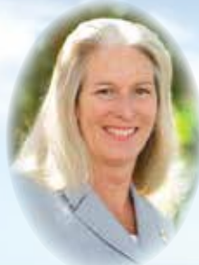
A Rivendell Resident

My top priority is going beyond the expected to deliver an Exceptional Real Estate Experience for home buyers and sellers.