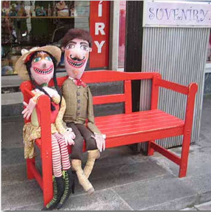
Whimsical street art