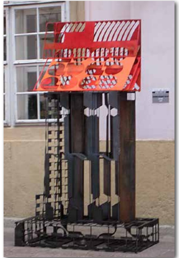
Modern Sculpture