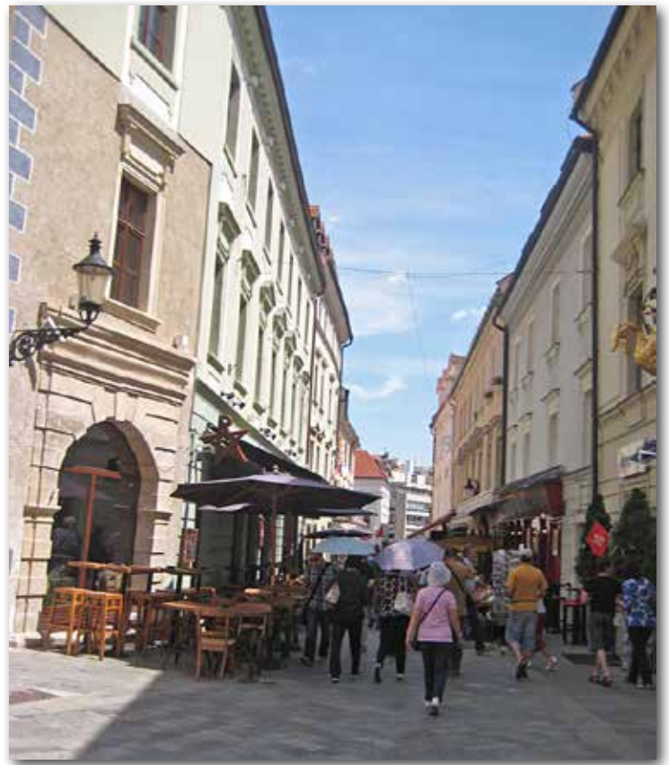
Walking the streets of Bratislava

It sits on both sides of the Danube River, making it a hub of activity with visitors and business people from several countries. It borders both Austria and The Czech Republic, and it is no surprise that its population is from multiple countries. Our young guide was very insightful in explaining the generation gap between his parents who grew up under Communism, and young students like himself who believe, and revel in, their newfound democratic freedoms. Bratislava is a little jewel and I only wish we had had more time to explore it more thoroughly.