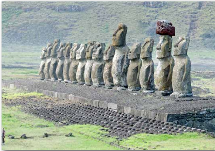
Ahu Tongariki the largest ahu, has 15 moai. Note the size of the person in the lower left hand corner.

Easter Island has a sad part to its history. Europeans began visiting in the 1700's exposing islanders to common colds, measles and other diseases killing hundreds of people. After that, Brazilian and Peruvian slave hunters raided the island, and by 1862 the original islanders were down to 100 and their culture completely destroyed. Wooden tablets with their only known written language were lost to translation when all the clan leaders died in the raids. Chile annexed the island in 1888.