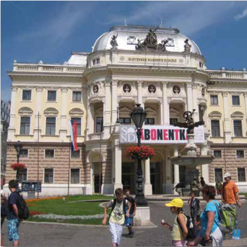
Bratislava Concert Hall