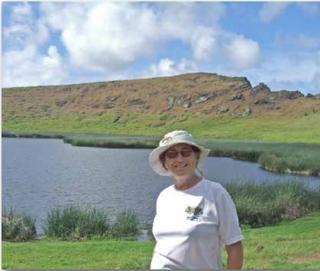
Rano Raraku Crater Lake

We trekked across the island searching for traces of its past beginning at the coast. The coastal areas have over 1500 moai (towering stone statues,) some recently repositioned upright by archeological teams, others left where the natives in the early 1800's had over-turned them. We walked across open grassy plains strewn with volcanic rock, any of which could cause a twisted ankle. As we hiked to the summit of dormant volcanoes on ancient roads, we were filled with wonder passing moai abandoned centuries ago. We came across ancient villages with only stone foundations remaining, discovered petroglyphs and caves. It was daunting at first but we climbed down steep cliffs to reach large caves.