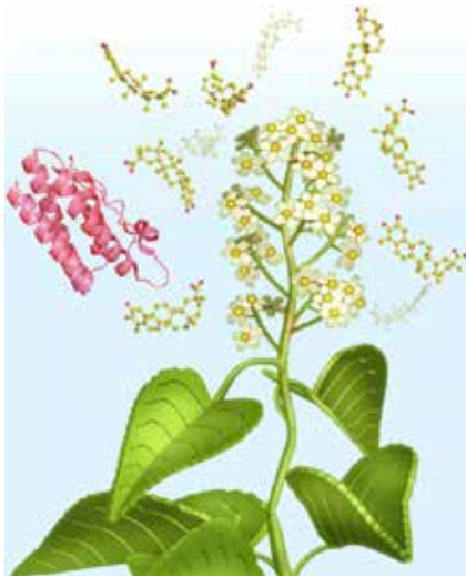
Thunder god vine, a traditional Chinese medicinal plant